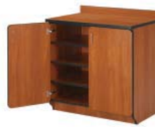
Base Cabinet With Doors/Shelves 72047