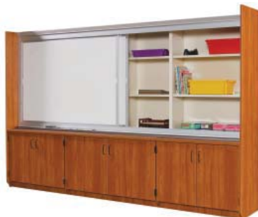
Learning Wall (call for details) 77004