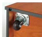
Caster Assembly Heavy-duty swivel casters (and levelers) come standard on floor cabinets up to 72" high (excludes sink cabinet).