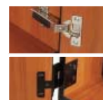
Hinges • European 125° door opening • Hospital tip 270° door opening