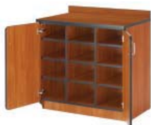
*Base Cabinet With Doors/Cubbies 72727