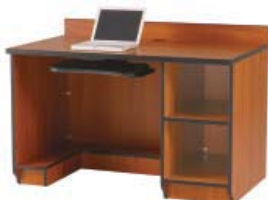
Student Work Station 79407