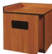
Base Corner Filler 71104