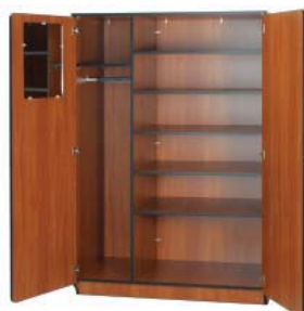
*Teacher Wardrobe 77087