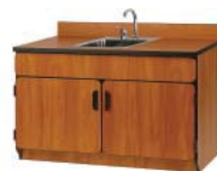
Sink Cabinet 72184 Not sold with sink and faucet