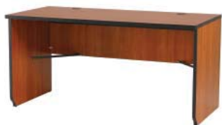
Work Table 79604

Shown with options: A. Keyboard Tray with Mouse 70.2545 B. Marker Board 70.7980 C. Tackboard 70.7990 D. Fold Down Door-Shelf 70.7920