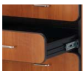
Steel Drawer Cabinets feature full steel drawers.

*Cabinet holds tote trays. Trays sold separately. Contact dealer for information