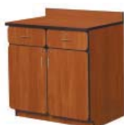
Base Cabinet With Doors/Drawers 72247