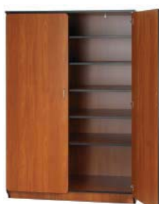
*General Storage 77057