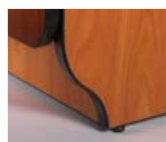
Toe Kick Contemporary design is both attractive and hides casters giving the units the built-in look.