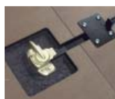
Locking Device Fleetwood's locking device allows each base cabinet in the run to be connected for greater stability.