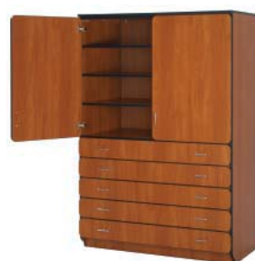
Shelf/Drawer Cabinet 77607