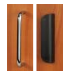
Door Pulls Two types available: • 1/4" wire pull • flush style