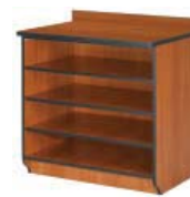
*Base Shelf Cabinet 72007