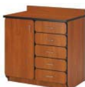
Base Cabinet With Door/Drawers 72327