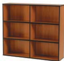
Hutch Cabinet 76200