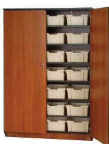
*Tray Cabinet 77287