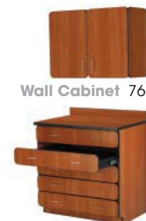
Base Drawer Cabinet 72567