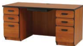
Teacher Desk 79207