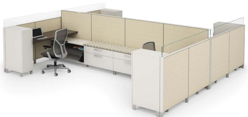
Shown with Stride panels